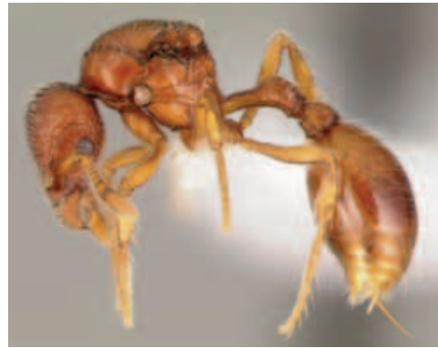
FIGURE 2. Image created using Syncrosopy Automontage software.

Renner and Ricklefs (1994) claim that systematists should not see themselves as “service providers”, for this will take away from the intellectual validity of the discipline and sap it of it